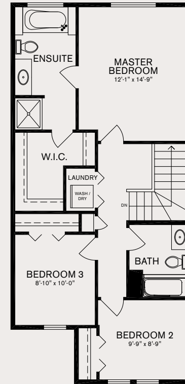
UPPER 758 SQ FT